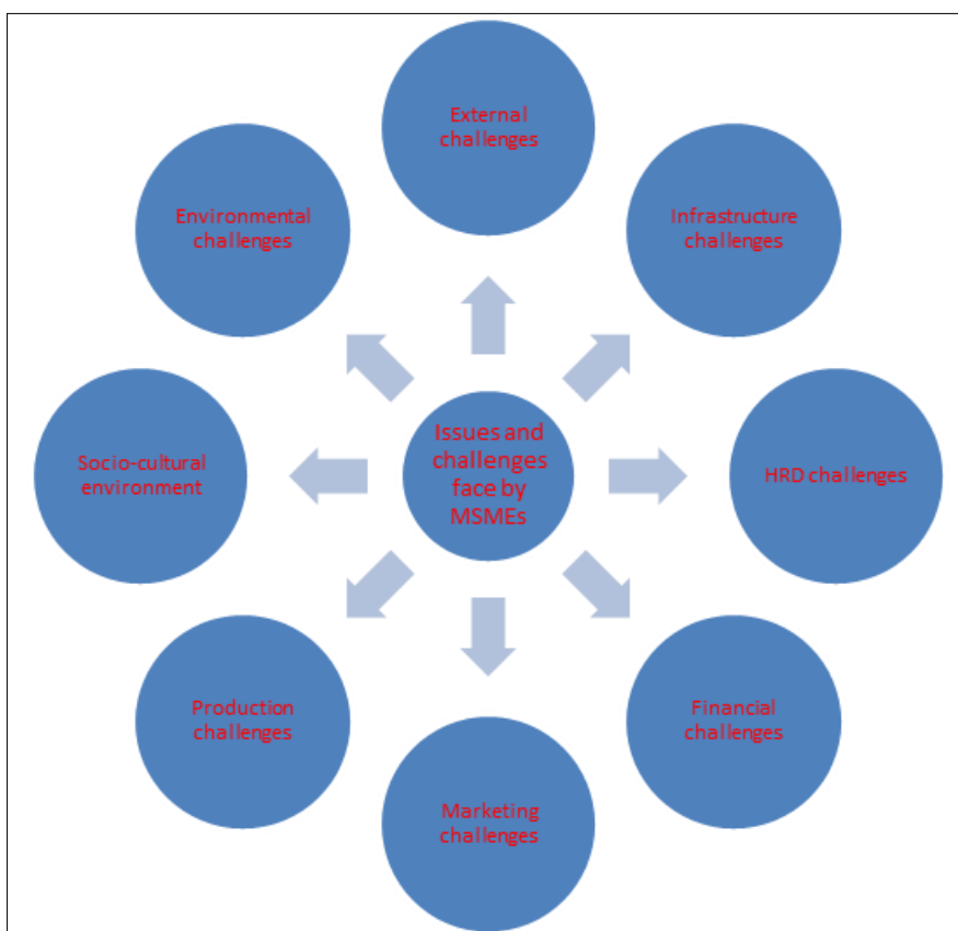
Fig 2: Showing issues and challenges of MSMEs

Hence from the above discussion it is clear that there are many challenges influencing MSMEs. Among them major are production, marketing, financial, human resources development and infrastructure etc. from above all issues and challenges external challenges are also not avoidable in nature as they occur because of environmental changes which not in organization control but internal challenges and issues can overcome and avoidable through certain safety measures and through management involvement.